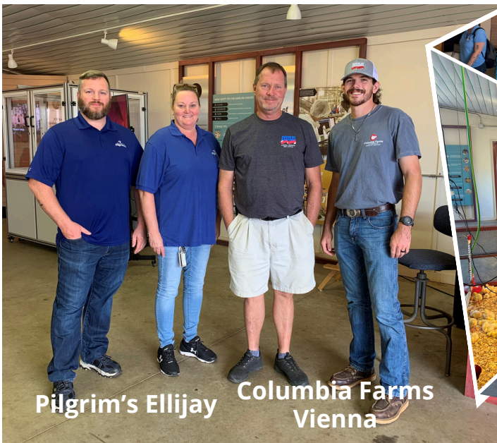
Pilgrim's Ellijay Columbia Farms Vienna