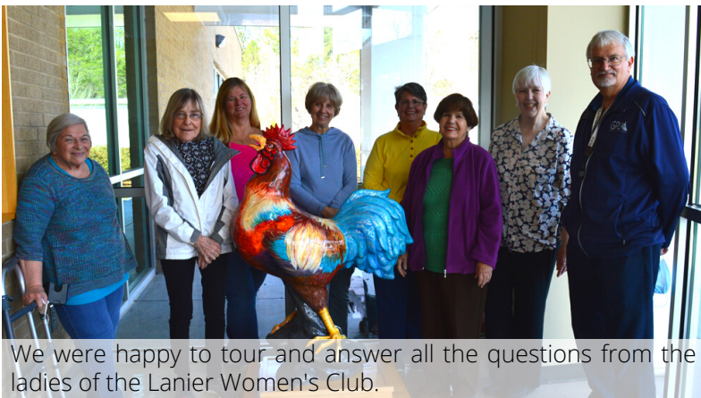
We were happy to tour and answer all the questions from the ladies of the Lanier Women's Club.