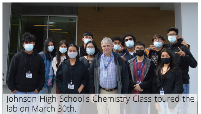
Johnson High School's Chemistry Class toured the lab on March 30th.