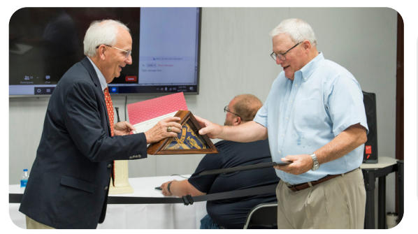
We wish you all the big fish you can catch, all the best tee times you can play, and all the fun travel you could ever want in your retirement.