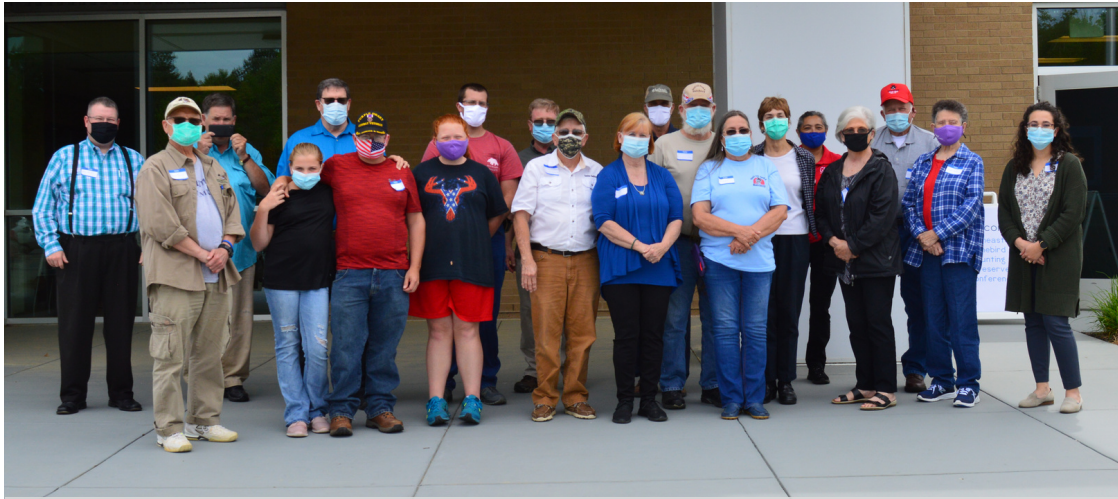
April 2021 brought together almost 30 individuals to meet for the Southeastern Gamebird Breeders & Hunting Preserve Conference.