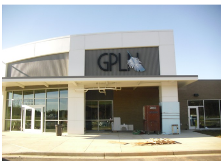
Front Entrance with GPLN Logo