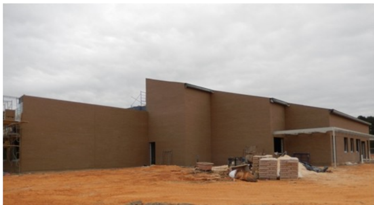
Nice Brick Work on the Southern Wall Near the Necropsy Department

The masons, electricians, plumbers, and air handling technicians are very busy installing their components. The new lab construction is right on schedule and the exterior facade is over half complete. The metal roof was started in late November and will be complete early in December. Metal studs are going up fast as the inside of the lab is starting to take shape.