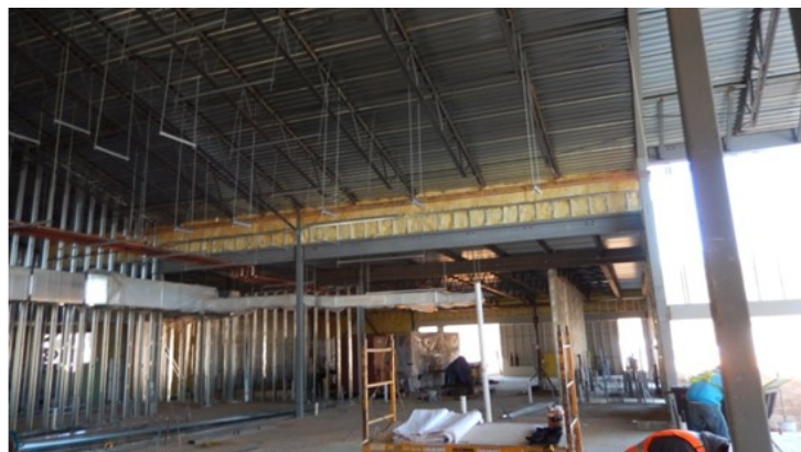
Partitioning of the Lab Departments