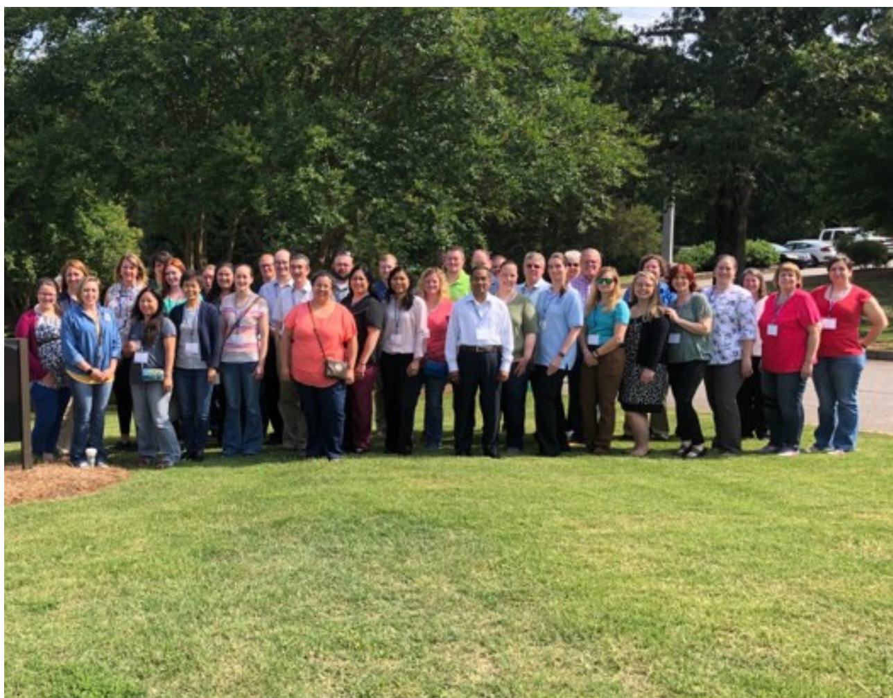
Group photo of the participants, presenters, and helpers from the 2019 NPIP Avian Influenza Diagnostic Workshop held at the PDRC in Athens, GA.