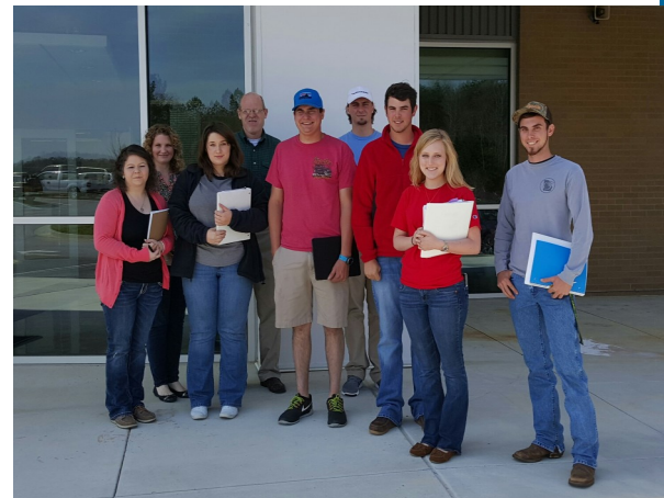
UNG Poultry Science Students