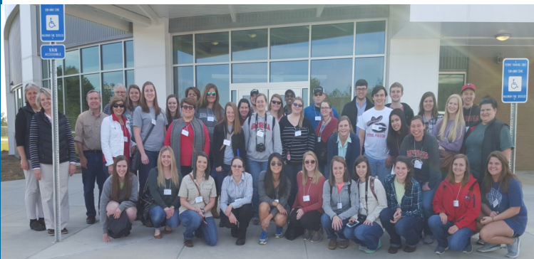
UGA CEAS Students