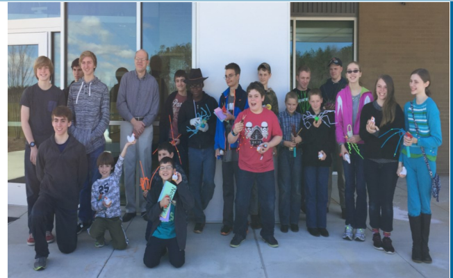
Hall County Home Educators