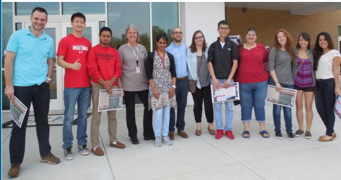
UGA Poultry Science Students