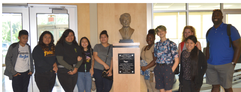
Rising 9th graders from the Gainesville City School System stopped by to tour the lab during their summer break.