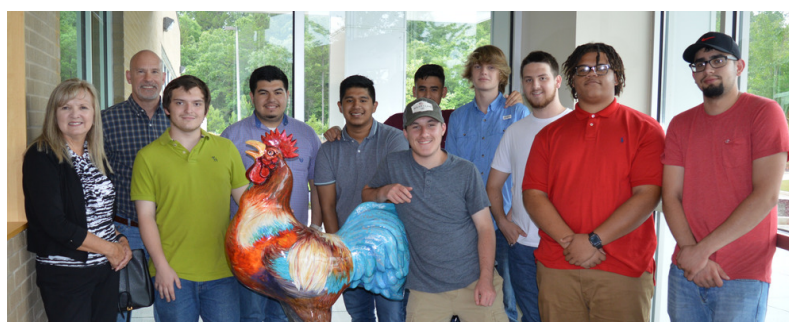
Lanier Technical students and teachers before touring the lab.