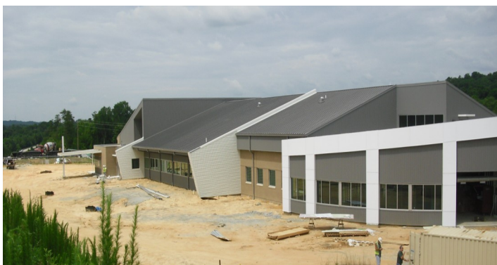
Front View of New Laboratory

The New Laboratory Construction: The drywall finishing and sanding are being completed, ceiling tiles are being installed and much painting is being done as the New Lab moves closer to completion. The lab's material completion date is September 28. The project is running a little bit behind schedule from the original mid July completion date.