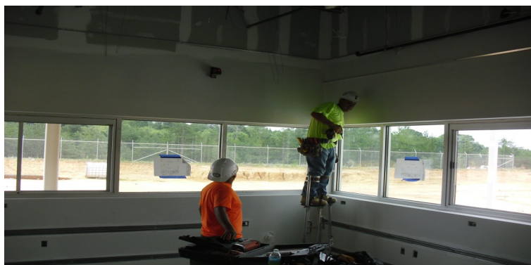
Ceiling Tiles Track Being Installed In the Receiving Department