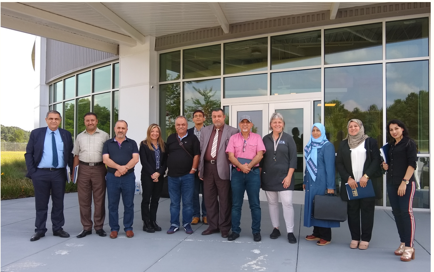
USAPEEC and delegates from Iraq visited the lab July 30-31st.