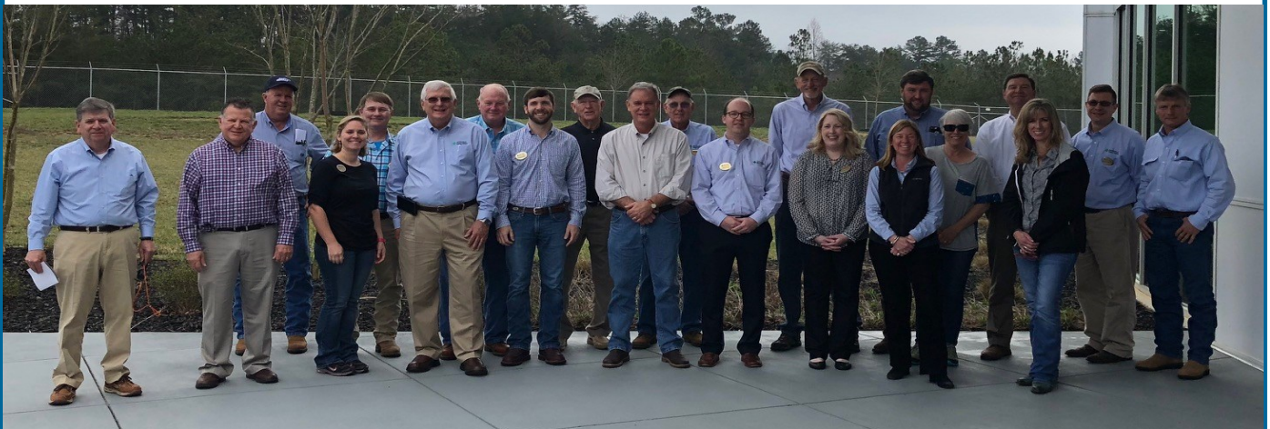
Representatives from AgGeorgia Farm Credit toured the lab and the diorama.