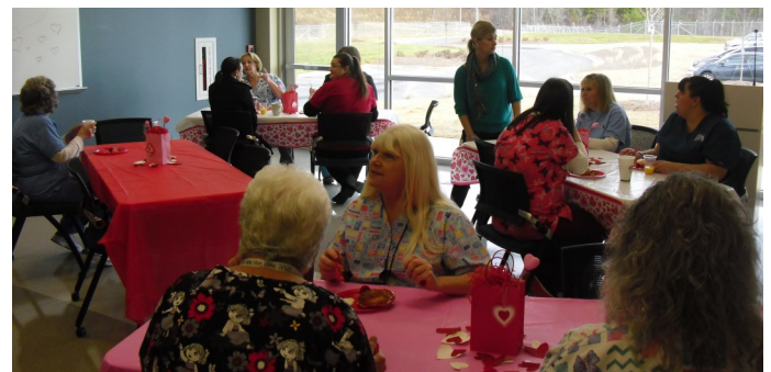
Employees Enjoying the "Loving the Lab" Breakfast Outing

Employee Valentine Breakfast "Loving the Lab" was a success. Employees were provided a delectable continental breakfast full of pastries from Panera as well as fruit and yogurt trays. It was another fun filled gathering and a wonderful opportunity to enjoy the Dry Lab in our new facility.