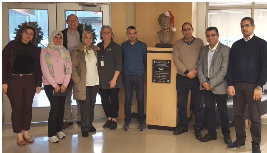
Egyptian guests, through the Georgia Council for International Visitors, enjoyed an in-depth tour of the lab.