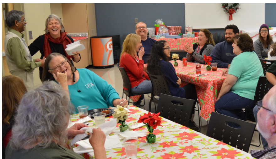
The GPLN Employee Christmas Party was filled with lots of joy and laughter!