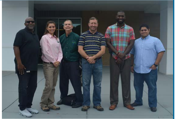
The USDA Office of Diversity and Inclusion toured the lab on August 31.