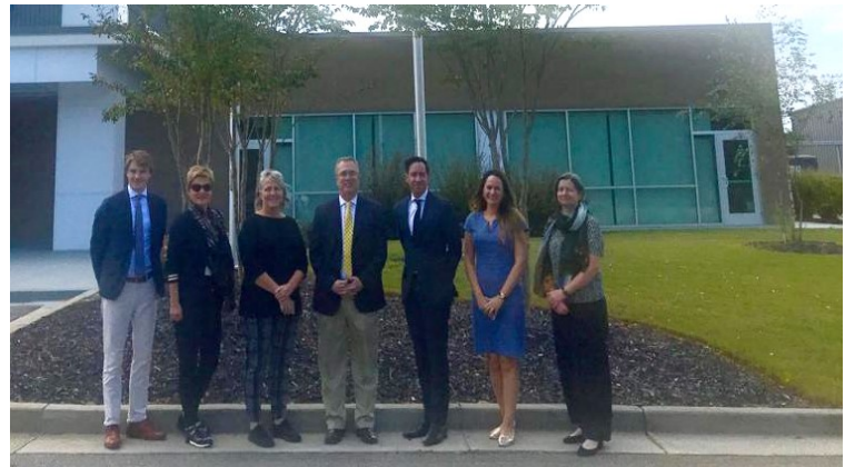
Dutch Delegation from the Washington DC Embassy & the Atlanta Consulate